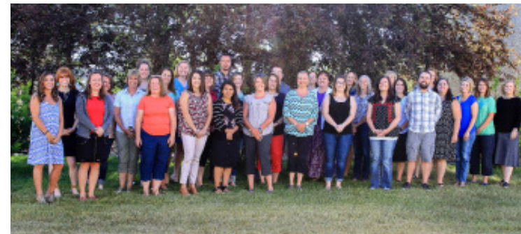
Wyoming Stewardship Project Writers, 2017

"We truly appreciate the time and effort that went into the development of this unit. It covered a lot of standards, especially the new science standards and the social studies standards that are harder for us to get to during the day, due to all of the things we have to teach."